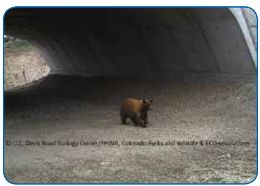
Black bear utilizing one of the underpasses.

If you have questions about the project, please leave a message on the project hotline or email us. You will receive a response within 24 hours.